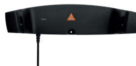
CW1 wall charger [05]