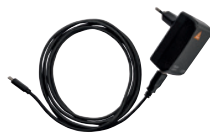
E4-USBC power supply with cable [04]