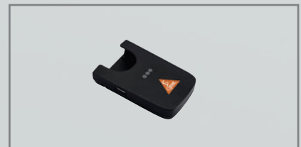
CC1 charging case [02]