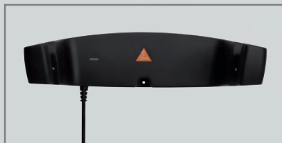
CW1 wall charger [05]