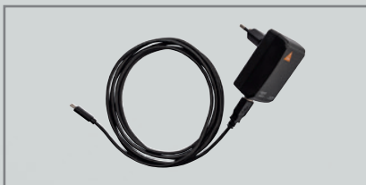
E4-USBC power supply with cable [04]