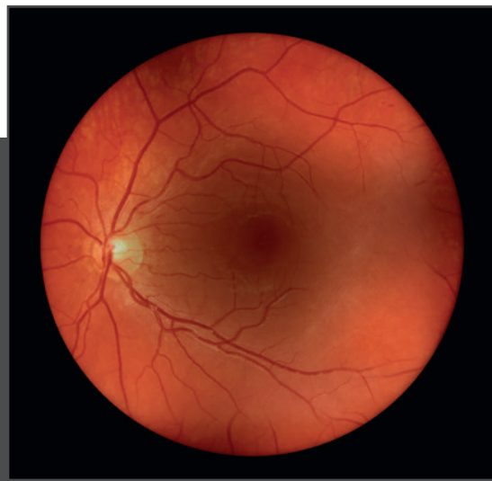
View of a retina through a cataract with visionBOOST*